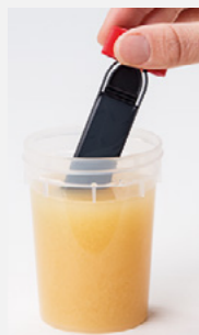
Dip, press or swab